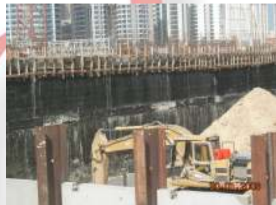
Excavation at Wind Tower II's construction site

For the latest progress and pictures from Wind Tower I and II, please visit: