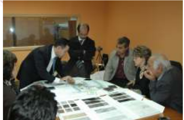
Wind and Polycor officials meeting

During the meeting, Polycor's representative showcased the company's proposals for both towers. Preliminary decisions indicate favoritism towards combining flamed, polished and honed stones. White Georgian and Black Cambrian stones were among the Wind officials' favorites to be chosen for the lobby of both towers.