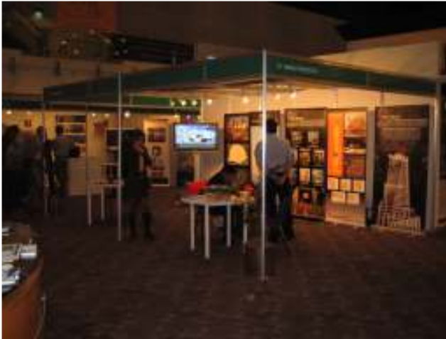
Wind Properties stand at the Home Owner Dubai

Wind International's upcoming launch at Dubailand was previewed yet again for the public, who took a keen eye towards the projected, thirty-plus storey high-rise tower at Athenopolis.