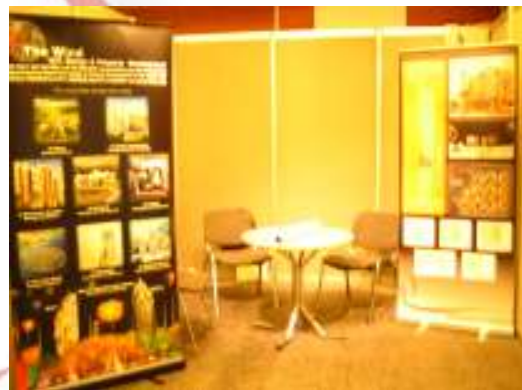
Wind Properties exhibiting at Dubai Property Show at the Novotel London West Hotel