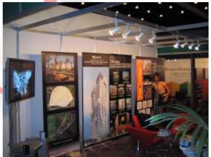
Wind Properties stand at the Home Owner Dubai

Later during the week, Home Owner Dubai 2006 took place at the Madinat Arena, Madinat Jumeirah, Dubai. One of the major property exhibitions on the calendar in Dubai, HOD proved to be a success yet again. Wind Properties represented Wind International, making it the second year in succession during which Wind International was participating at the event.