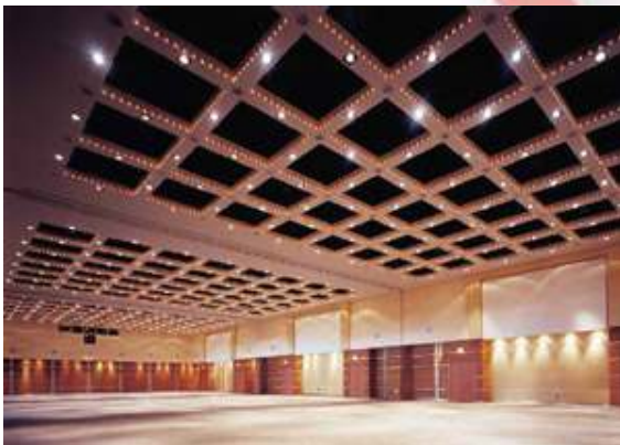
The exhibition hall venue at the Novotel West London Hotel