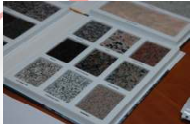
A selection of stones on display by Polycor during the meeting