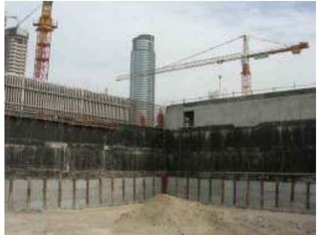
Wind Tower II Construction Site