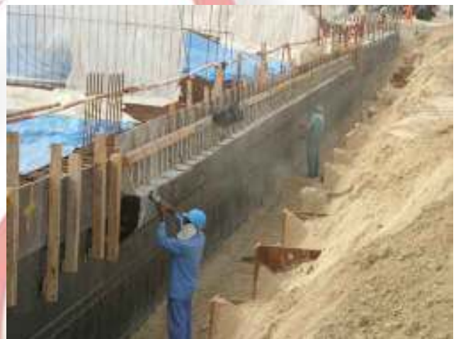
Water-proofing external parking wall