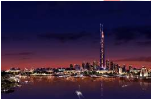
Nakheel's Al Burj in the midst of Madinat Al Arab