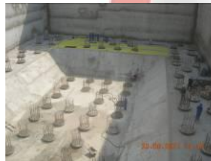
Placing the yellow membrane

By the end of the previous week a yellow membrane was placed on to ground where it was fitted by the waterbars. The screed protection began yesterday at the Wind Tower I site and the reinforcement is due to begin by Wednesday of the current week.