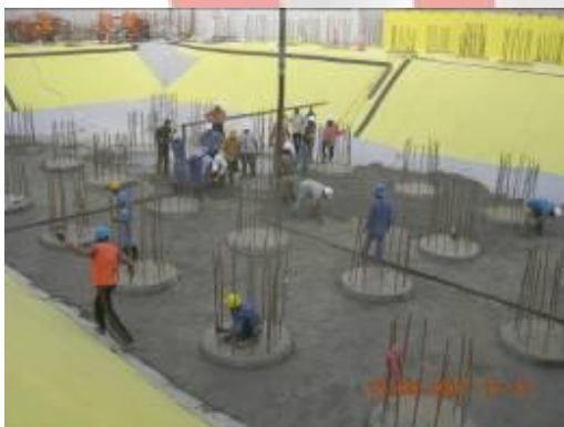
Screed Protection Wind Tower I