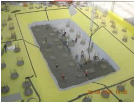
Screed Protection Wind Tower I