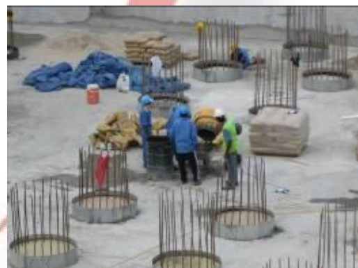
Water Proofing Wind Tower II