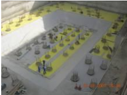
Placing the yellow membrane Wind Tower I