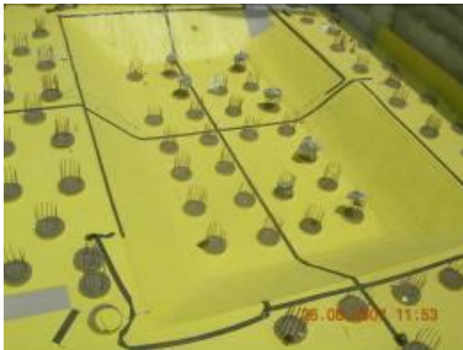
Yellow membrane placed (part of Water proofing)