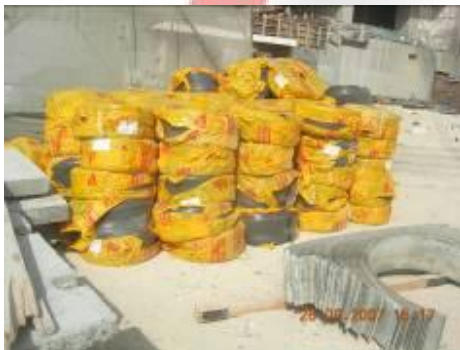
Materials arrived for water proofing

With regards to the reports given by the Engineers of Wind International Design and Property Development, the deadline of Jumeirah Lakes Towers is end of the year 2008.