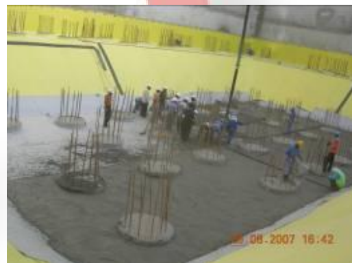
Screed Protection Wind Tower I

http://www.faravand.org/wind%20process/process%20page.htm