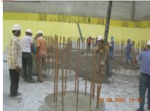
Screed Protection Wind Tower I