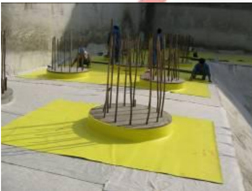
Placing the yellow membrane

http://www.faravand.org/wind%20process/process%20pageII.htm