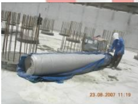
Materials arrived for water proofing

During the previous week, water proofing continued at the Wind Tower I site. This process has many steps including preparation of the pile which includes “pile cut to reach to the desired level “and “cleaning the concrete of the pile”. After that PVC