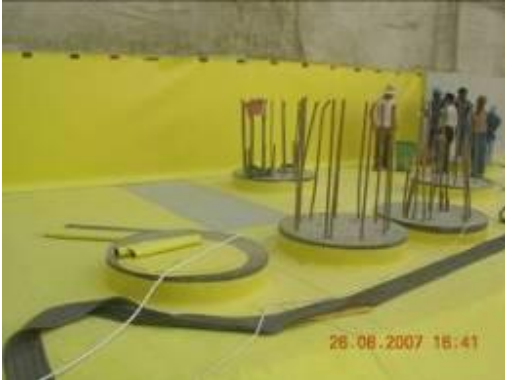
Placing the yellow membrane Wind Tower II