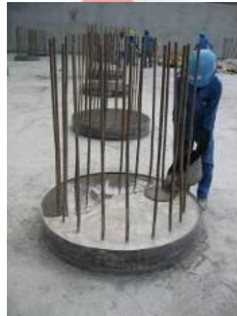
Pouring micro Concrete

took place which is a process where a waterbar( a rubber sheet) was placed around the piles, where then a micro concrete was poured on to the pile after which it had to dry for a day and a half. After the mentioned process a chemical substance was poured onto the pile.