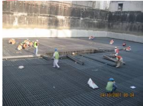
Reinforcement Wind Tower II

http://www.faravand.org/wind%20process/process%20pageII.htm