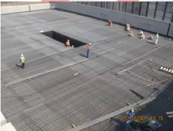
Reinforcement Wind Tower II

http://www.faravand.org/wind%20process/process%20pageII.htm