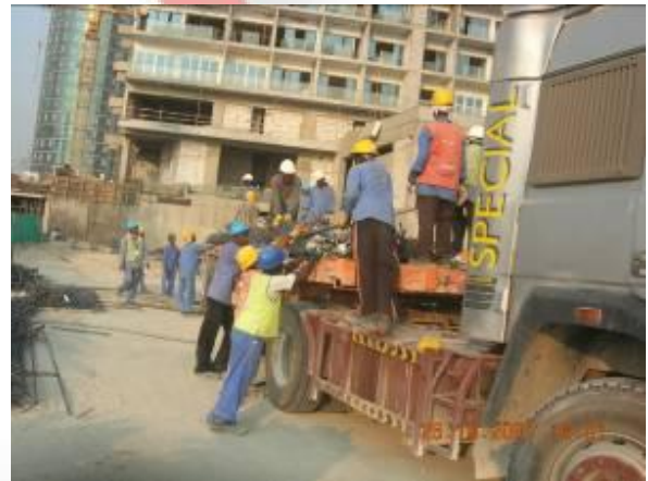
Material Received for reinforcement Wind Tower II

During the week that went by the reinforcement continued at Wind Tower II. The supervision was finally done and approved by the consultant, and the inspection which was done by JAFZA has been approved, where once the concrete is received, the raft foundation will be poured.