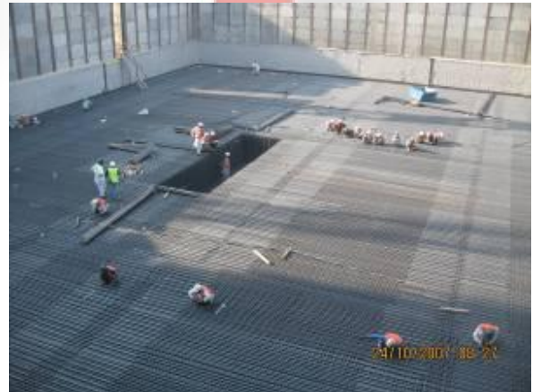
Reinforcement Wind Tower II