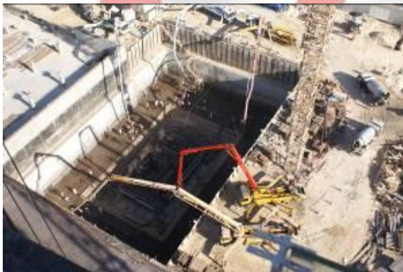
Concrete pouring of Wind Tower I

Last week on 13.12.2007 concrete casting of Wind Tower I started, around 3000 cubic meter of concrete was poured & casting of the floor of basement 5 finished at 2:00 a.m 14.12.07.