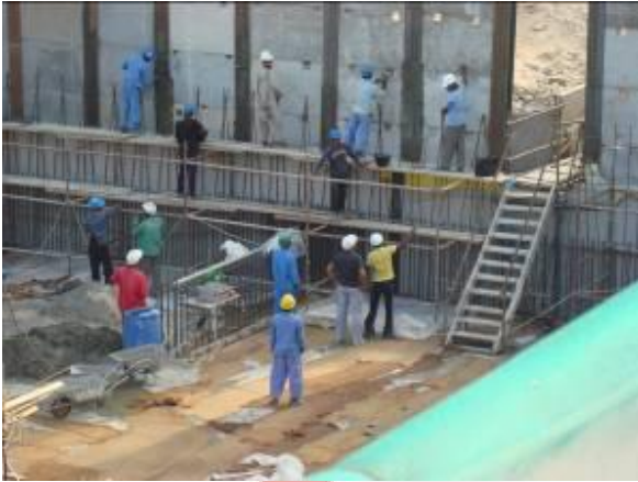
Scaffolding & plastering of Wind Tower II