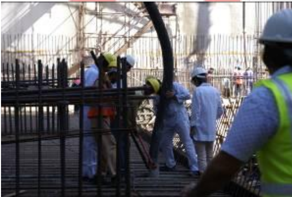
Concrete pouring Wind Tower I