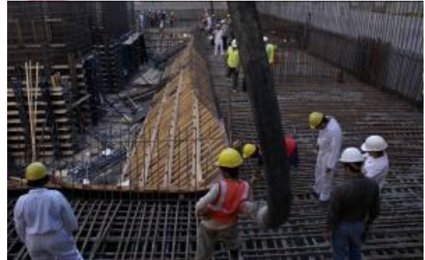
Concrete pouring Wind Tower I