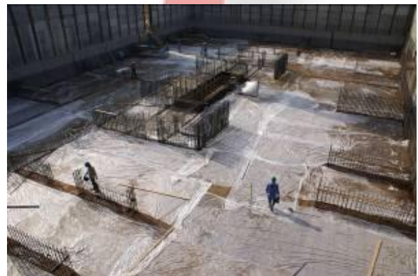
Curing of Wind Tower II

On 07.12.07 casting of Wind tower II for the floor of the basement 3 has finished. Stage of curing also finished.