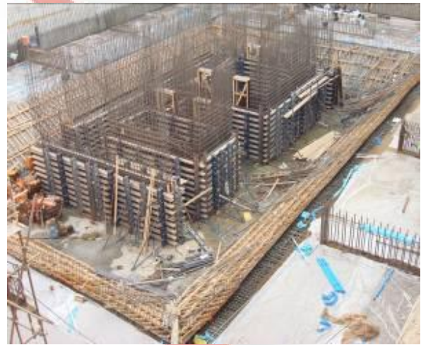
Shuttering of central core finished, wind Tower I

Curing is under progress till Thursday 20.12.07. Shuttering of the central core & columns has finished & ready for casting which will be done today.