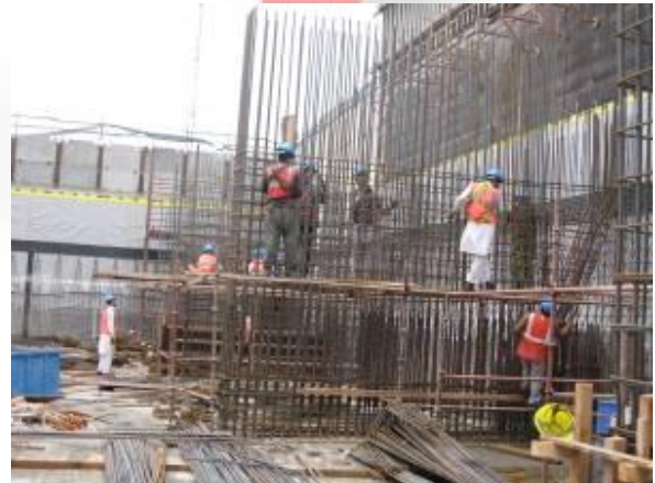
Wind Tower II

For more picture & videos kindly click on the links below: