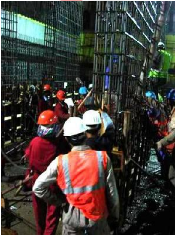
Wind Tower II