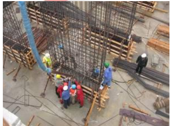
Casting in Wind Tower II

All the above mentioned procedures for both towers were accomplished during holidays & under tough situation of non-stop raining.