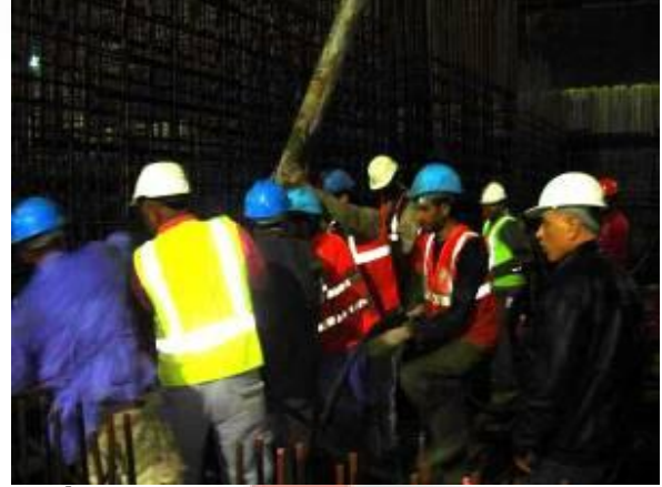
Wind Tower II