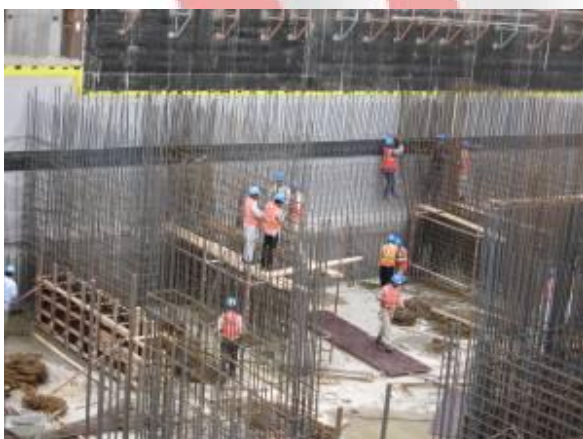
Water proofing Wind Tower II