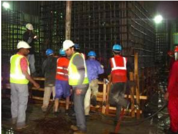
Slab Casting Wind Tower I