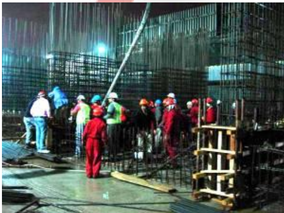
Casting Wind Tower I