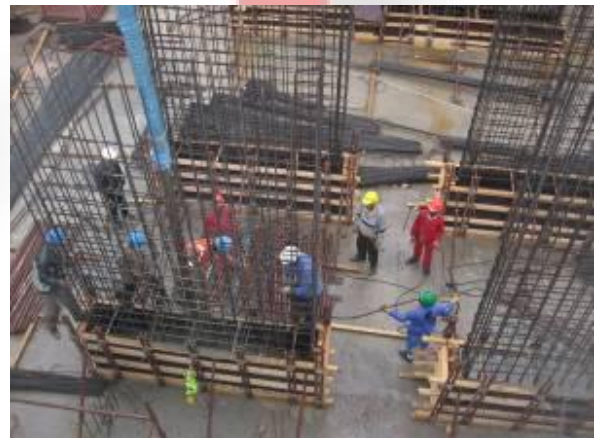
Casting of vertical elements Wind Tower II