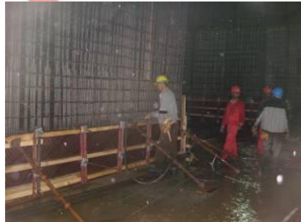
Casting during rain in Wind Tower II