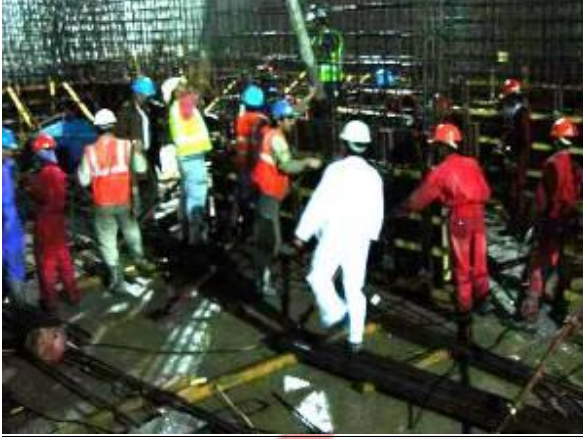
Wind Tower I