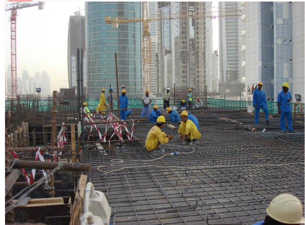
Wind Tower II

*** WE ARE PROUD TO ANNOUNCE THAT OUR COMPANY HAS BEEN LISTED AMONG THE APPROVED LIST OF DEVELOPERS IN U.A.E. CODE No. 254, ESCROW ACCOUNT HAS BEEN OPENED For more detail go to the following link: