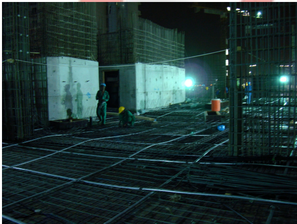
Wind Tower I