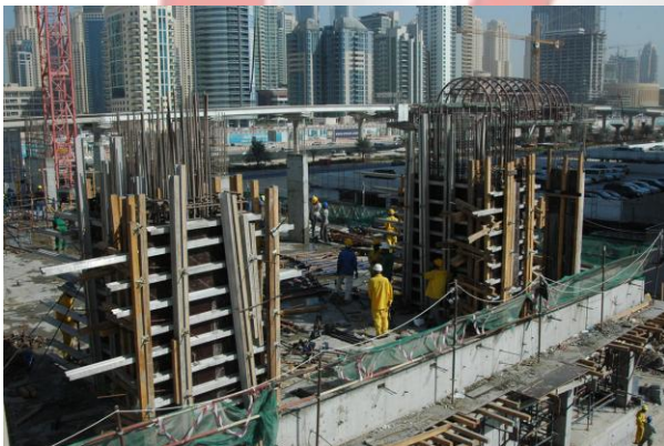
Wind Tower I