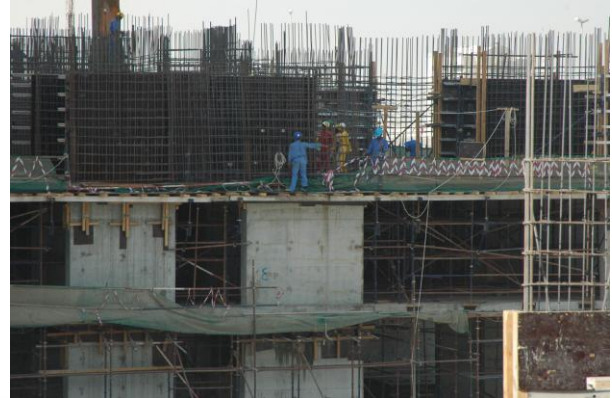
Wind Tower II

*** WE ARE PROUD TO ANNOUNCE THAT OUR COMPANY HAS BEEN LISTED AMONG THE APPROVED LIST OF DEVELOPERS IN U.A.E. CODE No. 254, ESCROW ACCOUNT HAS BEEN OPENED