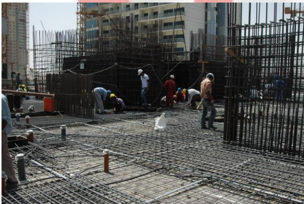
Wind Tower I