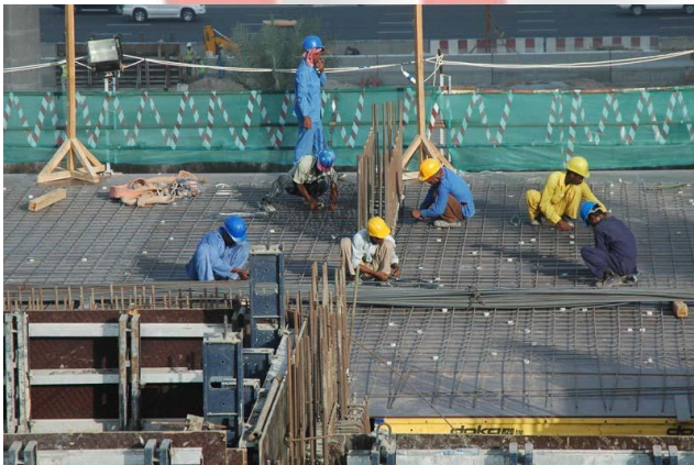
Wind Tower I