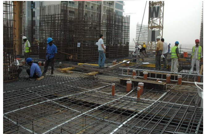
Wind Tower II

*** WE ARE PROUD TO ANNOUNCE THAT OUR COMPANY HAS BEEN LISTED AMONG THE APPROVED LIST OF DEVELOPERS IN U.A.E. CODE No. 254, ESCROW ACCOUNT HAS BEEN OPENED