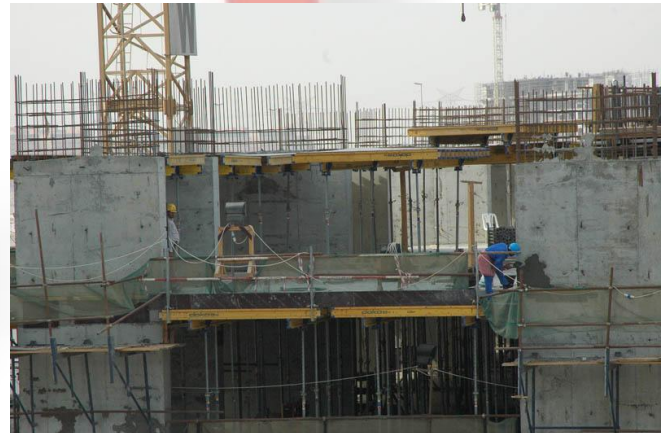
Wind Tower II

*** WE ARE PROUD TO ANNOUNCE THAT OUR COMPANY HAS BEEN LISTED AMONG THE APPROVED LIST OF DEVELOPERS IN U.A.E. CODE No. 254, ESCROW ACCOUNT HAS BEEN OPENED