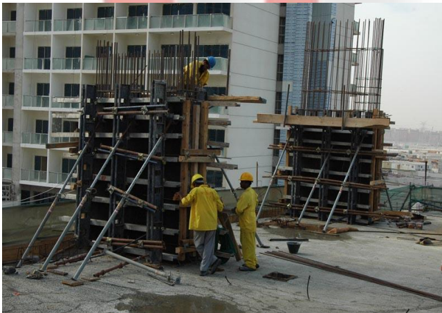
Wind Tower I