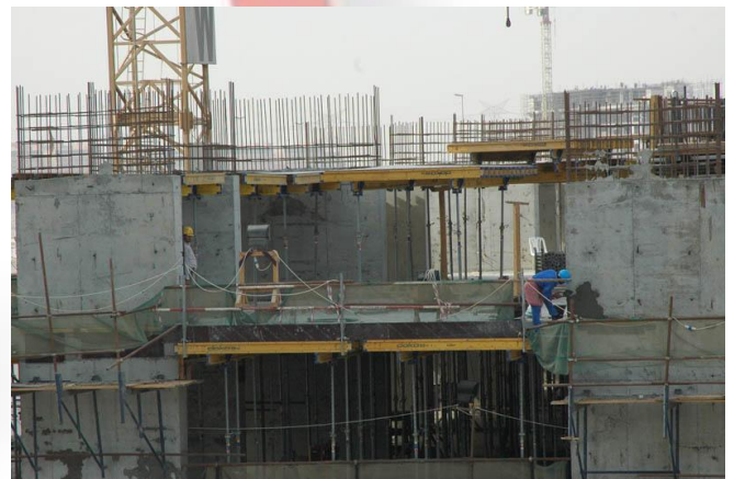
Wind Tower II

*** WE ARE PROUD TO ANNOUNCE THAT OUR COMPANY HAS BEEN LISTED AMONG THE APPROVED LIST OF DEVELOPERS IN U.A.E. CODE No. 254, ESCROW ACCOUNT HAS BEEN OPENED